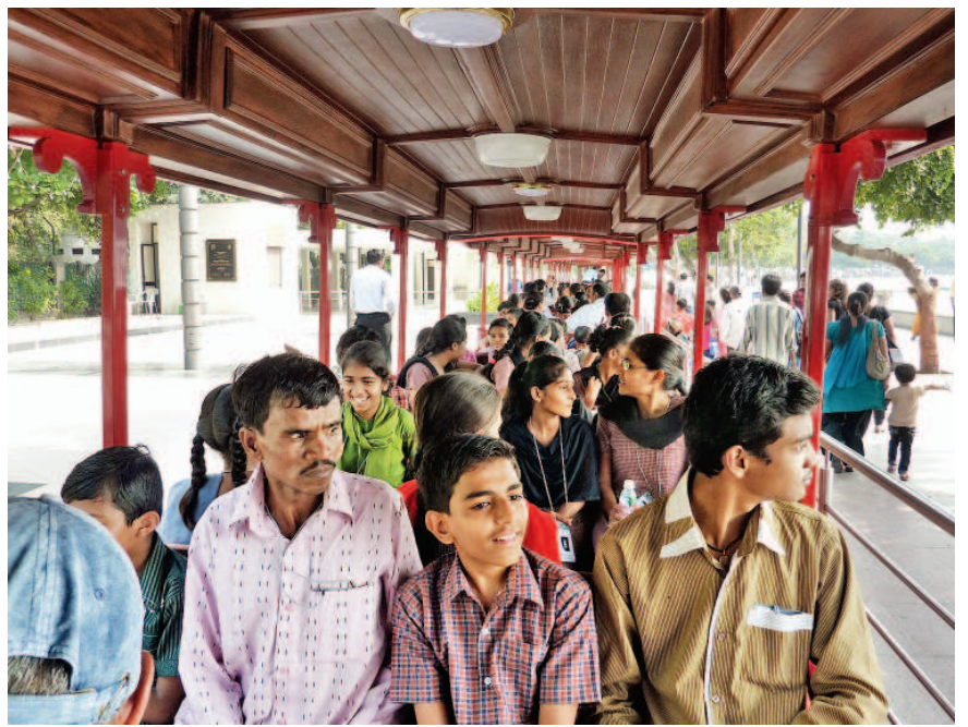
On World Children's Day on Sunday, the Rotary Club of Ahmedabad, which is celebrating its platinum year, took underprivileged children of Bhudarpura to Kankaria Lakefront where they enjoyed a balloon ride, train ride and also took the BRTS